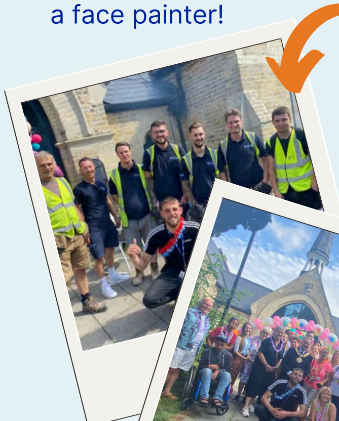
The staff at Houghton & Son popped over to get involved in the fun!