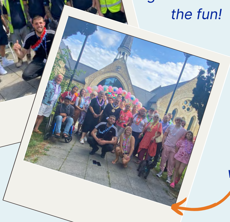
The Mayor also came by to say hello and to speak to residents and staff alike, as well as local councillors who all got involved and wore a Lei!